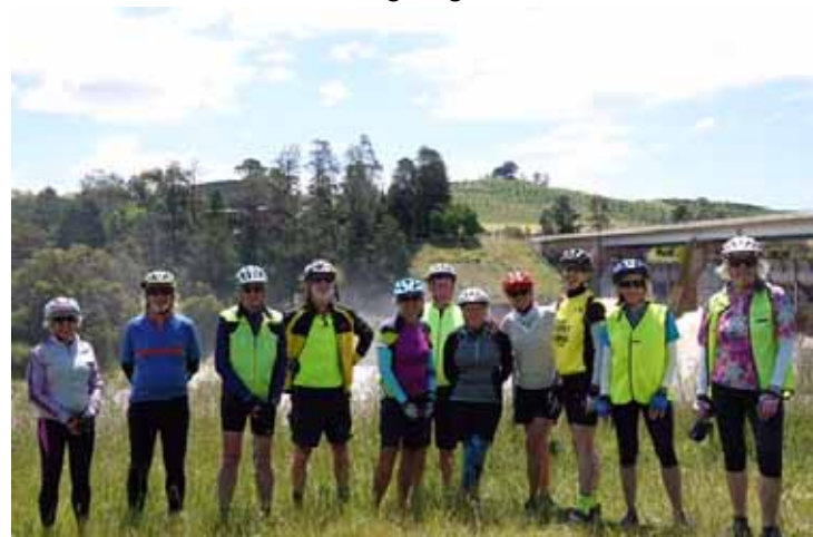
Pub to Pub participants