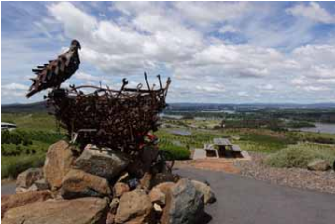
The eagles nest overlooking the National Arboretum