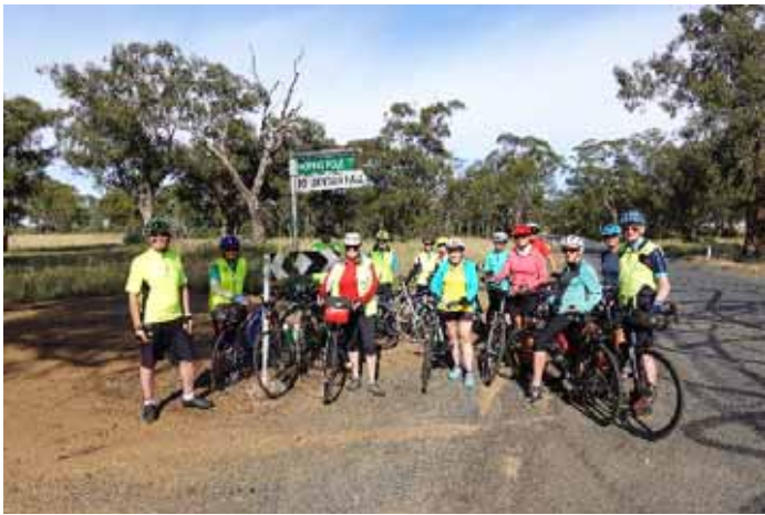
Day three start