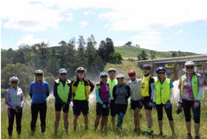
All smiles after a 70km day