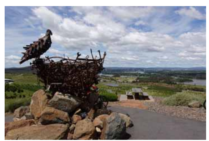
The eagles nest overlooking the National Arboretum