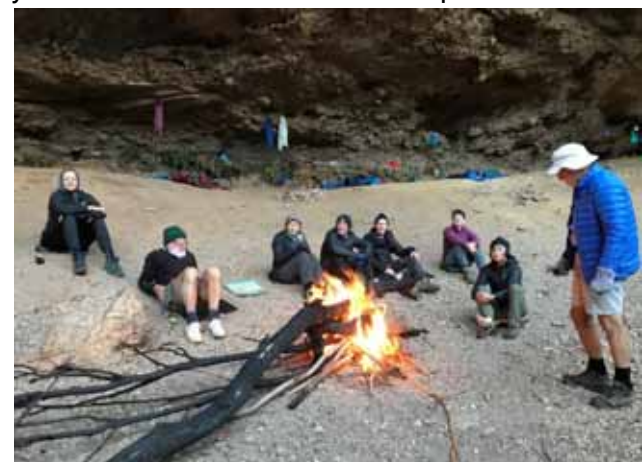
Day 2 We set off at about 8.30 AM in fine weather on our 20 km return day walk to Monolith Valley, carrying day packs and appreciating the lighter load. The

We reached our rock overhang campsite about 4 o'clock, collected water from the creek, set up bedding, cooked dinner and finished off a wonderful day with one of Tim's excellent camp fires.