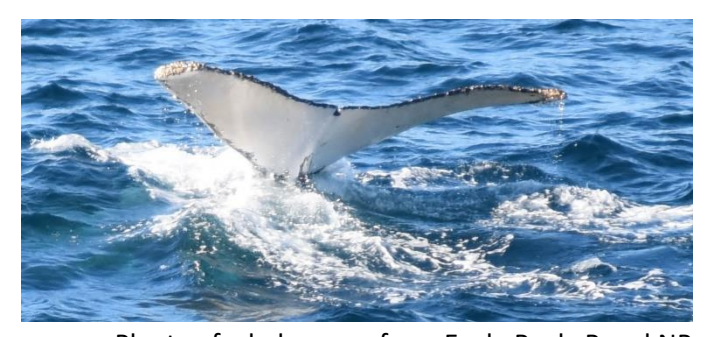
Plenty of whales seen from Eagle Rock, Royal NP