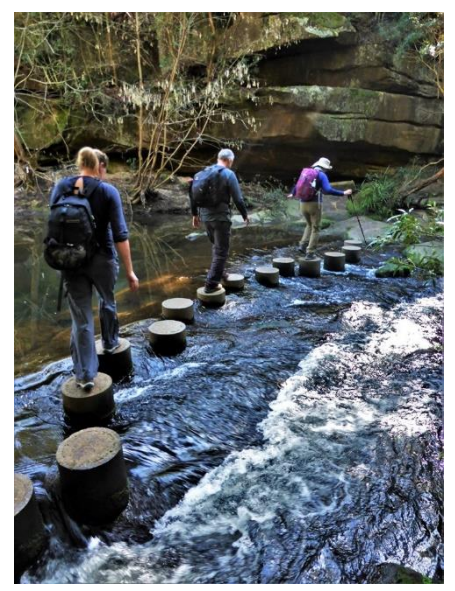
Thornleigh to Hornsby