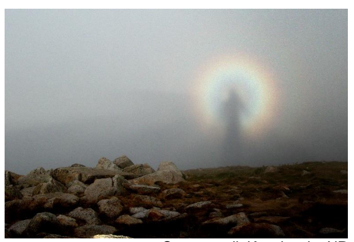
Sunset walk Kosciuszko NP

The activity programs in the Members Area have all the organiser and committee contact details.