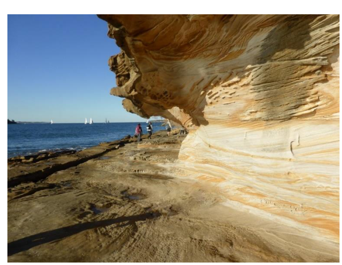
Costens Pt area Royal NP