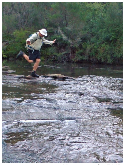
Kangaroo Ck RNP